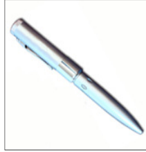
Silver USB Pen