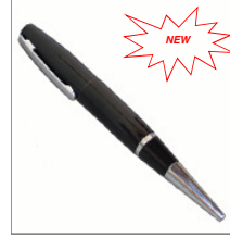
Black USB Pen