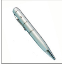
Laser pen Silver