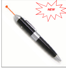
Laser Pen Black