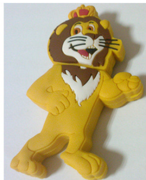
Picture sent for pantone approvals. Once happy go ahead given.